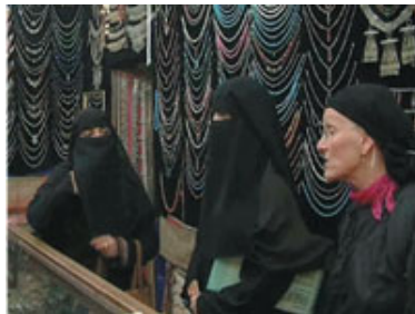
In a jewelry shop with a tourist wearing a Yemeni vial.