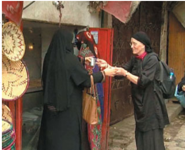
Old markets in old city of Sana’a, trying out Yemeni food.

This program gives a chance for tourists to imagine themselves as Yemeni grooms and brides while ddressing in the Yemeni traditional wedding clothes and practice certain heritage rites such as putting Hana and Nagish for the brides and wearing the Jambia and chewing qat in the after noon period for the male tourists.